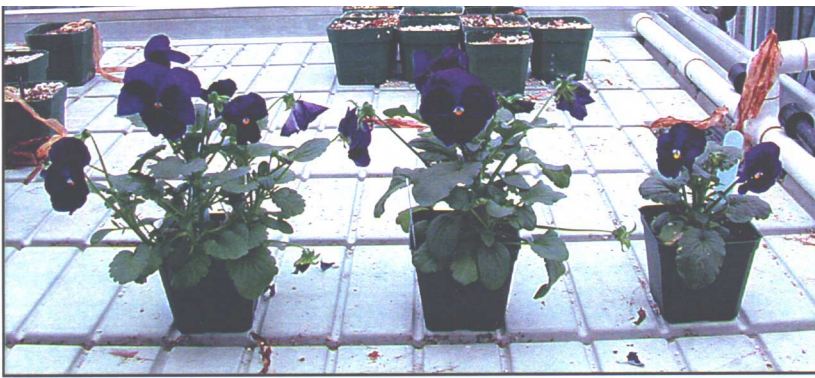
Figure 3. Pansy plants after 8 weeks of supplemental lighting. (BC Lights LU 400 on left, BCLights LU 250 in middle and PL 400 on right.)