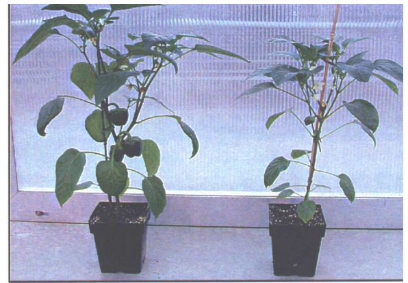
Figure 4. BC Lights LU 400 pepper plant (left) compared to PL 400 pepper plant (right) after 8 weeks of treatment.

All pepper plants had good foliage colour and looked healthy regardless of fixture type. After 4 weeks of treatment, the BC Lights LU 400 improved pepper growth in four of the five characteristics measured (Table 4). BC Lights LU 400 plants had more open flowers and buds, a larger stem diameter, and a greater fresh weight. There was no difference in plant height. BC Lights LU 250 plants had a larger stem diameter and greater fresh weight than the PL 400 plants. Number of open flowers, flower buds, and plant height were not different. BC Lights LU 400 plants had higher values for all characteristics except the number of buds which was greater in the PL 400 plants.